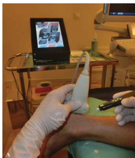
Figure 2A: Treatment of Achilles tendinopathy with ultrasound-guided EPI ® technique (EPI Advanced Medicine ® , Barcelona, Spain).

The EPI ® technique (Figure 2) achieves a very localized organic reaction in the clinical focus by using a specially designed EPI ® device for this purpose (EPI Advanced Medicine ® , Barcelona, Spain. EPI ® technique videos online: www.epiadvanced.com ), which leads to the rapid regeneration of degenerated tissue. This leads to the production of new immature collagen fibers that become mature by means of eccentric stimulus [32], thereby obtaining good results in the short and